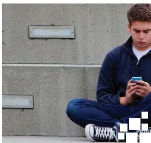
Connecting with teens